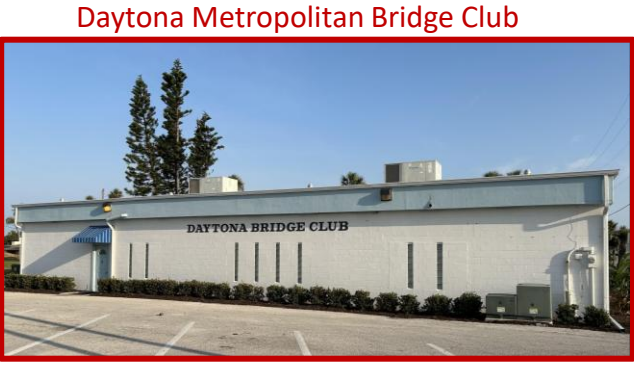
Daytona Metropolitan Bridge Club

600 Driftwood Ave. Daytona Beach, FL 32118