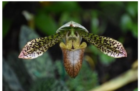
Lady Slipper Orchid from Messenheimer Garden